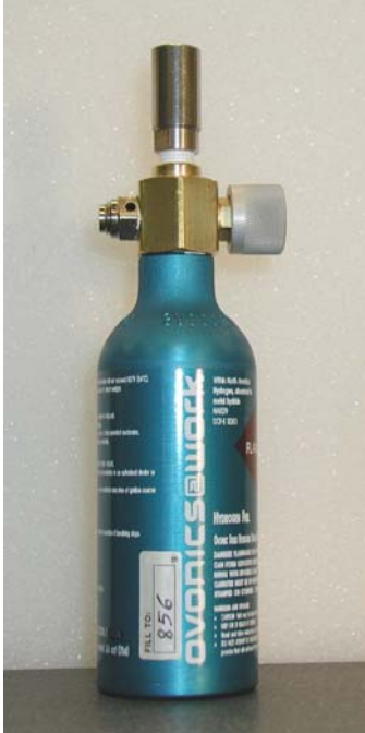
Shown with optional quick-connect coupling. Actual appearance may vary.