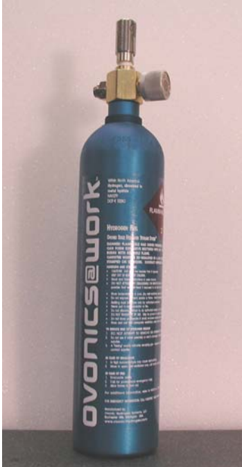
Shown with optional quick-connect coupling. Actual appearance may vary.